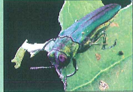
Emerald ash borer adult