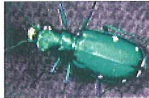
Cicindela sexguttata Fabricius