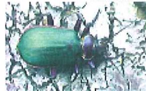
Cabsooma scrutator Fabricius