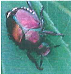
Popillia japonica Newman