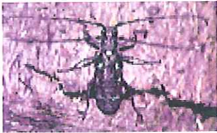
Monochamus scutellatus (Say)