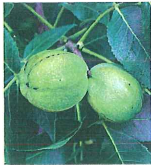
*Paul Wray, Iowa State University

Leaves are compound with 5 to 7 leaflets, but the plant has an alternate branching habit. Fruit are hard-shelled nuts in a green husk.