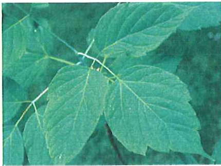
*Paul Wray, Iowa State University

Exhibits opposite branching and compound leaves. However, has 3 to 5 leaflets (instead of 5 to 11) and the samaras are always in pairs instead of single like the ash.